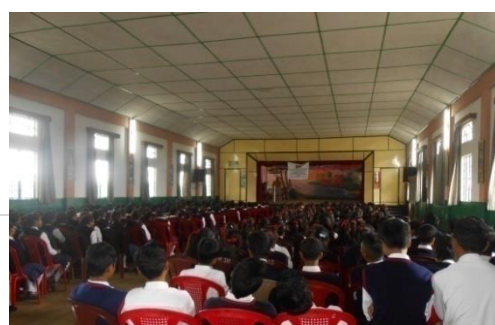
St. Peter's Higher Secondary School

In order to reach out to a large number of Children, the CHILDLINE NSSS is organising Outreach program for the students. The students were oriented on the significant role of